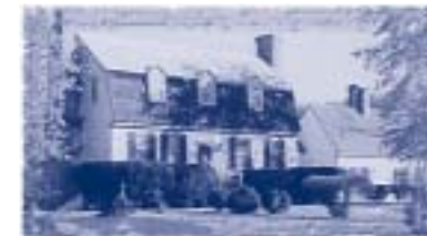
Stagg Hall, located in the Port Tobacco Historic District, has been listed on the National Register since 1988.

National Register designation is largely honorary, and does not limit the rights of private property owners. While owners are not legally restricted from making changes to historic properties listed on the Register, a number of incentive programs are intended to encourage the preservation of these important sites.