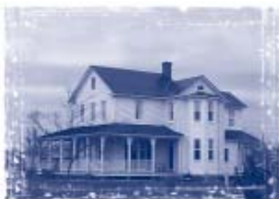
The 1893 Thomas Owne House is now designated as a local landmark in the town of La Plata. La Plata currently includes a number of properties protected under a historic preservation ordinance.

Local Historic districts or landmarks are created through zoning. Typically a local commission, made up of citizens and professionals, reviews proposals to alter the exterior of properties designated as historic under local law.