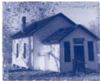
Port Tobacco One-Room Schoolhouse

Historic resources are buildings, sites, structures, districts or objects, fifty years of age or older, that are significant to our local or national heritage. In Charles County this includes many types of resources, from one-room schoolhouses to 1850s plantation houses, from Victorian farmhouses to 19th century tobacco barns.