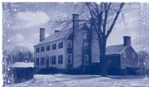
Properties listed on the National Register, such as Rose Hill, are eligible for a range of preservation incentives.

The Maryland Building Rehabilitation Code, "Smart Codes," is an important tool for historic preservation by establishing safety requirements that make sense for rehabilitation work without creating unnecessary regulatory barriers. The Code applies to work requiring construction permits (building, electrical, plumbing, etc.) on any building more than one year old. To learn more about Smart Codes and their application, visit www.dhcd.state.md.us/smartcodes .