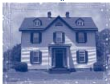
Edgehill Farm is beautifully restored and now protected under a preservation easement.

A preservation easement is a legal instrument designed to preserve a historic property in perpetuity without transferring ownership. Preservation easements ensure the structure's protection by limiting changes to the restored exterior. In most cases easements are recognized as a charitable donation and eligible for federal and state income, gift or property tax incentives. The Maryland Historical Trust (MHT) holds over a dozen preservation easements in Charles County.